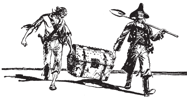
ILLUSTRATION BY EDWARD O. WILSON, 1928